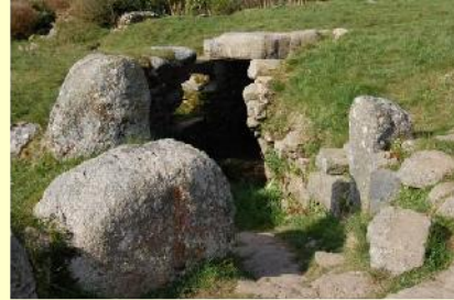
Carn Euny Settlement

Carn Euny Settlement (Grid Ref: SW402 288)