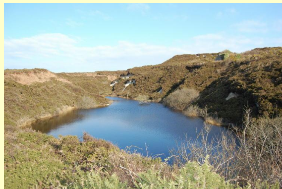
China Clay Works

From the car park at Chapel Carn Brea, return to the road, turn right and almost immediately turn left, crossing the road and passing through a gate to join a wide track. Follow the track ahead, ignoring a left turn and continue ahead to pass between two granite posts and a sign warning of mine shafts. The track continues across Tredinney Common and passes its disused China Clay Works on your left. Ignore any paths off the main track and after some distance you start to go down hill, passing through another wooden gate and continue ahead to pass between the remains of St Euny's Chapel and its two Holy Wells.