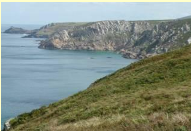
Looking back along the coast path to Bosigran Cliff and Gurnards Head

Retrace your route for 30 yards and turn left over a granite stile next to a gate. Follow the path ahead and continue through a wooden gate. Pass through a second wooden gate and continue ahead to cross a granite stile to reach the Coast Path. Turn left and follow the Acorn symbols of the South West Coast Path. The path provides dramatic views but is well worn and easy to follow. Continue until you descend steeply to reach the beach at Portheras Cove, which is worth investigating. Re-join the Coast Path and continue on to reach the light house of Pendeen Watch.