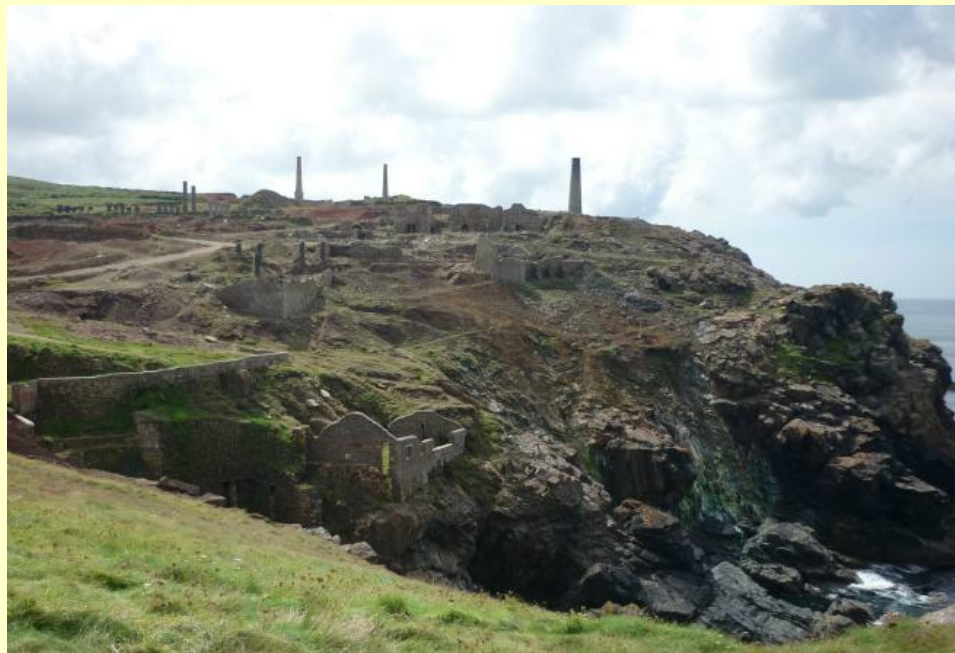
Old Mine Workings on the cliffs At Botallack

From the lighthouse head inland along the road and then rejoin the Coast Path at a turning on the right hand side, opposite some ex Coastguard Houses. The Coast Path now continues ahead, and passes through the site of Geevor Tin Mine, and then the site of the National Trust owned Levant Mine and Beam Engine. From the Beam Engine continue to follow the Coast Path's Acorn Markers to eventually reach the start point at the Crown Mines and Count House back at Botallack.