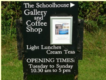
The School House Gallery and Coffee shop at Morvah