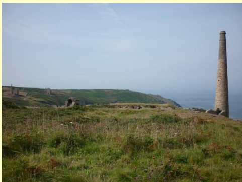
Solitary Chimney on the Cliffs

After 250 yards turn left to follow a broad grassy track. At a Way Marker the path turns right and then sharp left onto a lane. Continue along this lane, ignoring a turn on your left, and it will eventually emerge out onto a tarmac road close to the Hamlet of Botallack. At the road turn right and continue for 200 yards before turning left onto another tarmac road (Truthwall Lane) at the sign for Trevaylor Caravan and Camping Park. Follow the road until you reach a junction and then turn left and follow the road for 400 yards, ignore a lane which turns to the right in front of houses, and continue ahead on the road, and then turn right onto a grassy track. Follow the track, known locally as 'Devils Lane', up hill to reach Carnyorth Moor. The lane runs for 900 yards and ends at a gate. Pass through the gate and immediately turn right over a stile and then head diagonally across the field towards the remains of a broken stile.