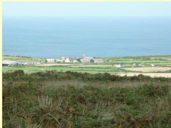
The Hamlet of Morvah

. Head across the field bearing slightly right and cross an electric fence to reach another granite stile. Cross the stile and continue ahead to cross a further granite stile with a Way Marking post to Morvah. Follow the left hand field boundary and cross three further granite stiles to reach the road. Follow the road ahead and turn right at the Morvah sign to reach the church