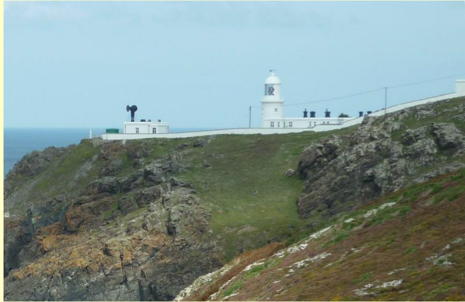
Pendeen Lightho use