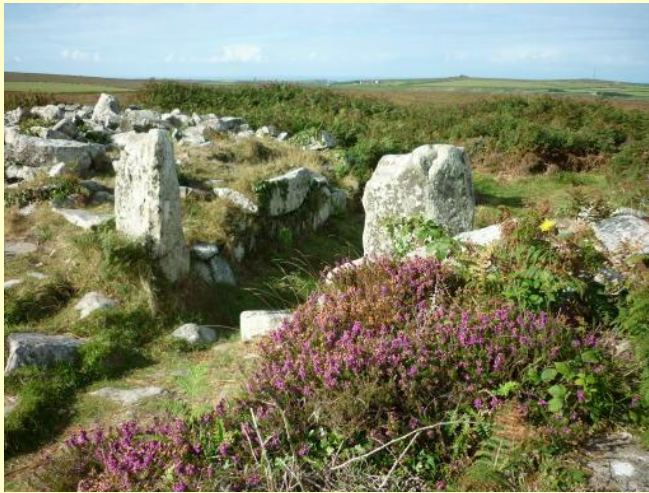
The entrance to Chun Castle

PAROW has been working for the last few years, to remove bracken from the site to encourage the re-growth of a more diverse range of wild flower and grass species.