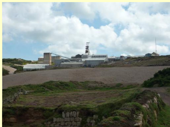
Geevor Mine—Now a museum