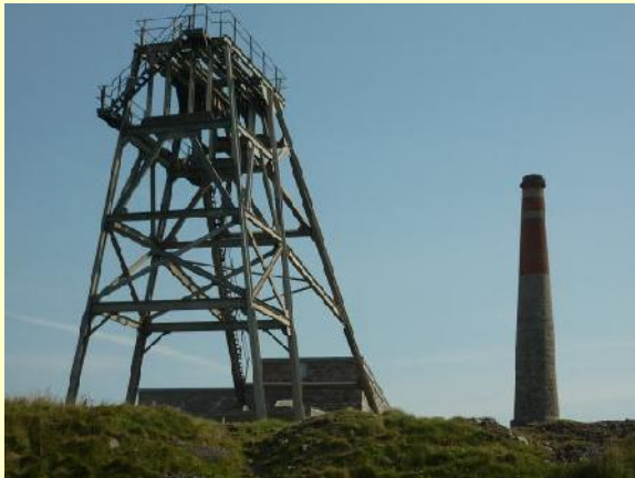
Mining remains both old and new close to the Count House