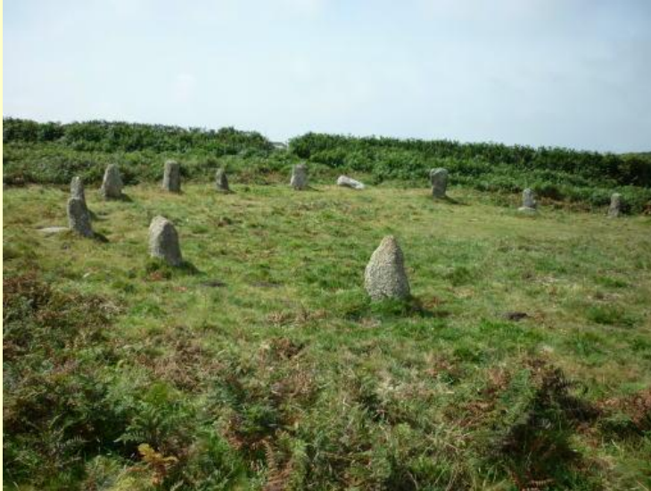
Tregeseal Stone Circle

Do not cross the stile, but follow the field boundary right on a faint path to a collection of rocks. Follow the path between the rocks and as it continues to weave its way through Gorse and Brambles to reach a Kissing Gate. Pass through the gate and continue ahead, passing a pond on your right, and continue onto a broad track. Follow the track ignoring a gate on your left and continue to reach a large farm gate with a smaller gate alongside. Go left through the gate and continue ahead to reach the stone Circle