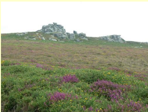
It is worth the effort to climb the Carn for the wonderful view!

From the Stones, head directly towards the large Carn ahead (Carn Kenidjack) on a track crossing the moor, running through heather. At a junction turn left and then after 300 yards turn right and continue ahead to reach an old Way Marker Post at a junction. Turn right and continue uphill and at another junction continue ahead on a broad track passing the Carn on your right and, with a Parish Boundary marker stone on your left, continue ahead towards power lines. Pass through a gate and continue down hill onto a wide grassy track.