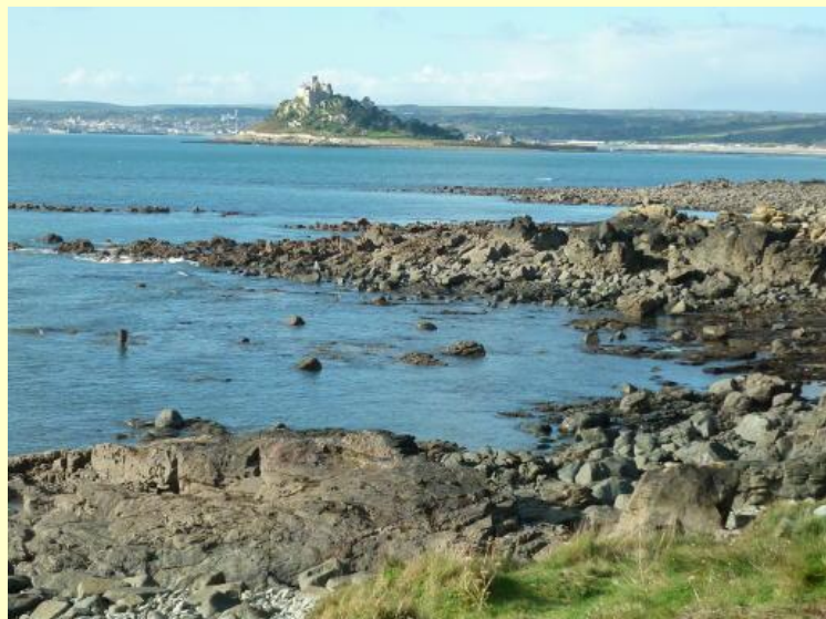
View of St Michaels Mount from the Coast path of Perranuthnoe.

Penwith Access and Rights of Way - this is a local community based organisation working with a wide range of partners including the West Cornwall Local Action Group and Cornwall Council to improve access to the countryside for both local people and visitors, with a particular interest in access to Penwith's diverse collection of Ancient and Historic Sites. It also aims to help encourage tourism for the benefit of local businesses and to offer people the opportunity to carry out practical conservation tasks.