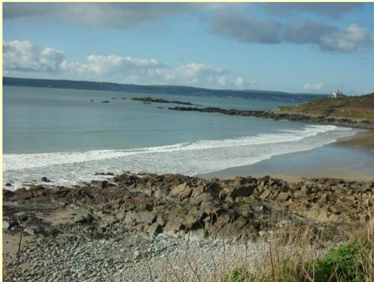
Above and below the beach at Perranuthnoe