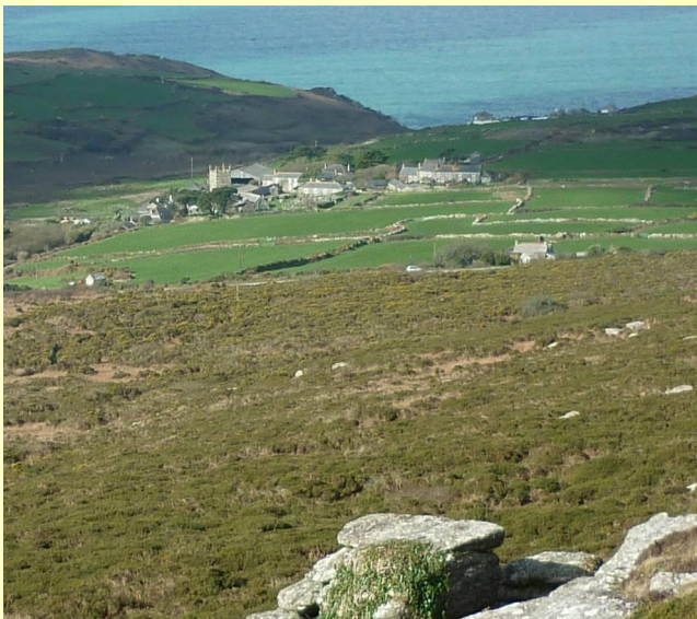
Left, View of Zennor village form the summit Zennor Hill