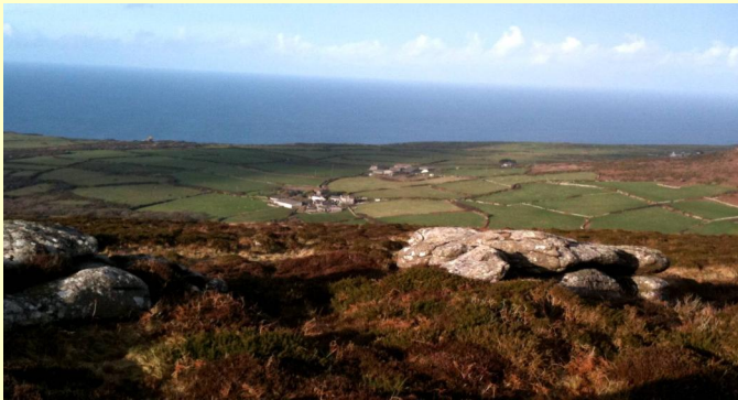
Looking back to Trendrine Hill from Rosewall Hill

On reaching Towednack Road turn left along the lane and after approximately 200 yards turn right at the Public Footpath sign over the stile and go uphill through a field, and continue as it changes to gorse until you reach a stile in the top right hand corner. Go straight ahead after the stile, beside a rocky outcrop which is the western end of Rosewall Hill and follow the path as it bears left to reach a gate. Ignore the gate on your left and continue ahead down hill, bear left and follow the hedge until it reaches a path. Follow the path right and continue down hill through two gates to reach a parking area. Cross the coast road, pass through a metal gate and follow the path over Trevalgan Hill heading towards the sea to reach a tarmac road after a wooden gate. Turn left and follow the lane for approximately 400 yards and turn left over a stile and gate into a footpath which you follow to reach the hamlet of Trevega and Trevesa Farm.