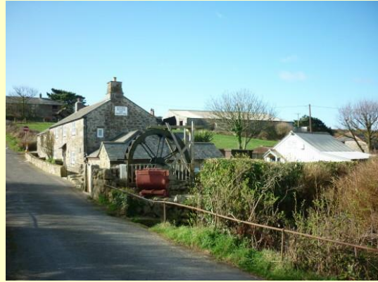
Wayside Museum and Trewey Mill at Zennor

path. After approximately 20yds turn left through a gateway and take the main path, bearing slightly right, and heading up hill. Keep following the rutted path as it zigzags uphill, keep left following a small 'T' Way Marker and ignore a right hand path. Note that the path up to Zennor Hill summit is not a definitive footpath it is just a path on Open Access land. Continue to follow the path uphill and it zigzags towards the summit following another small 'T' Way Marker. Bear right in front of a granite outcrop and continue ahead, then bear left passing another small 'T' Way Marker to reach the summit.