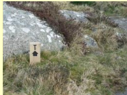
Small wooden 'T' Way Markers help with route finding