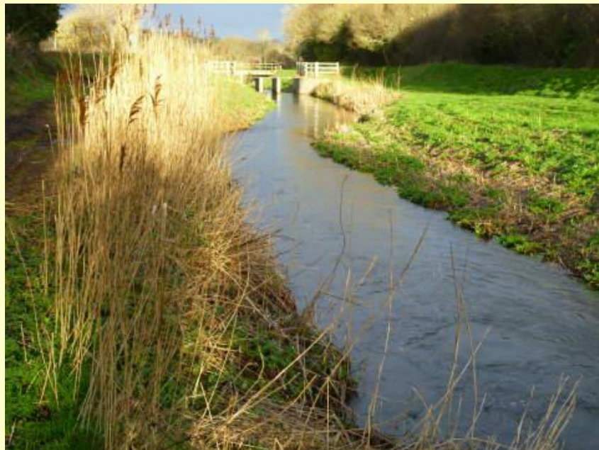
The Hayle River at St Erth

Penwith Access and Rights of Way – this is a local community based organisation working with a wide range of partners including the West Cornwall Local Action Group and Cornwall Council to improve access to the countryside for both local people and visitors, with a particular interest in access to Penwith's diverse collection of Ancient and Historic Sites. It also aims to help encourage tourism for the benefit of local businesses and to offer people the opportunity to carry out practical