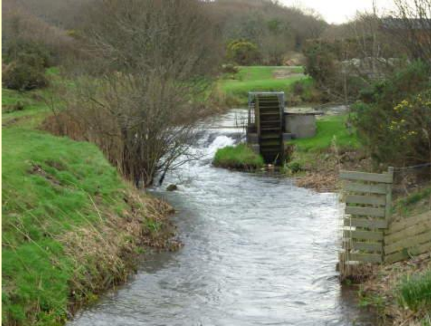
Old Water Wheel close to the Caravan Park

From the parking area opposite the parish rooms, with your back to river, turn right and follow the lane (Green Lane) straight ahead, past the dead and signs, for 0.6 miles until you reach a bridge over the river. Cross the bridge, turn left and follow the river bank for 2 miles. It passes an interesting Mill House on the right hand side, and a small pedestrian bridge on the left before continuing alongside a caravan park to reach an old granite bridge at the entrance to the park. The reception of the caravan park sells refreshments and ice creams for a half way break!