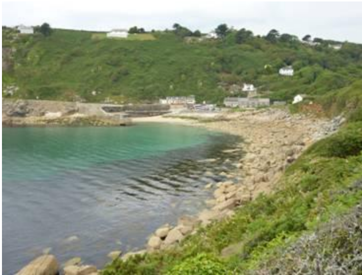
Lamorna Cove seen from the South West Coast Path

Some of the route is steep and rocky but is mostly well Way Marked and easy to follow. The path is approximately 8 miles long and takes approximately 4 hours to complete. There are toilets available in Lamorna and Mousehole and lots of opportunity for lunch or refreshment along the route.