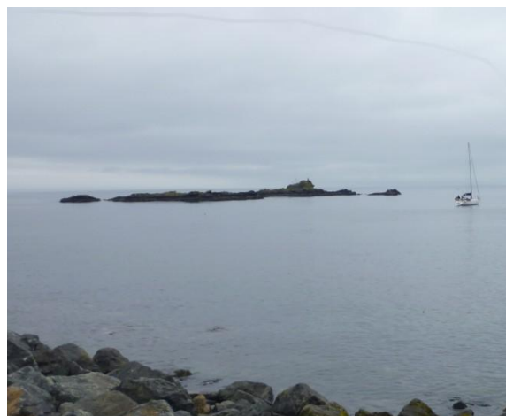
St Clements Isle viewed from Mousehole

The village is renowned as one of the most picturesque harbours in England. An islet called St Clement's Isle lies 400 metres offshore from the harbour entrance. Mousehole, along with Marazion, was until the 16th century one of the principal ports of Mount's Bay. Mousehole, like Penzance, Newlyn, and Paul, was destroyed in the 1595 raid on Mount's Bay by Spaniard Carlos de Amésquita, the only surviving building being the 'Keigwin Arms', a local pub. Outside the Keigwin Arms (now a private residence) is a plaque with the wording "Squire Jenkyn Keigwin was killed here 23rd July 1595 defending this house against the Spaniards"