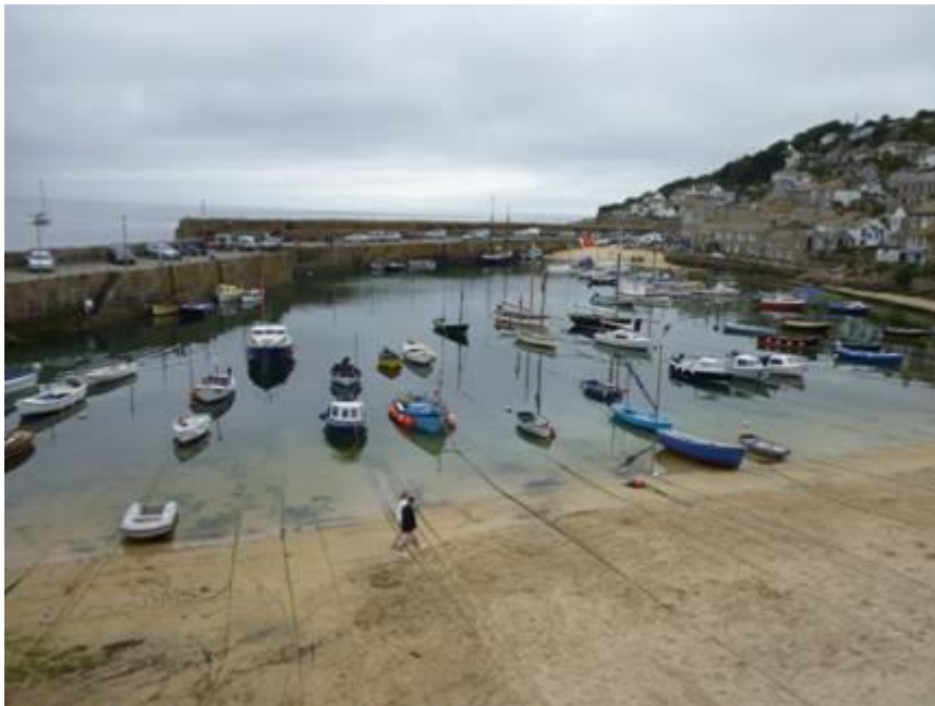
The Harbour at Mousehole

Follow the road through the village to reach the Post Office. Take the opportunity to look around Mousehole's many interesting shops and its lovely harbour.