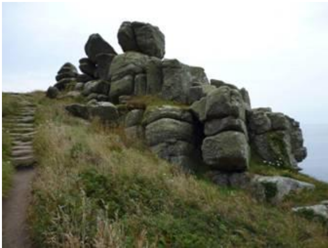
The Rocky Headland at the entrance to Lamorna Cove

From Lamorna Pottery, turn right onto the B3315 road go along and the road for approximately 0.2 miles then turn left onto a bridleway just before a bridge (sign is opposite the lane) . Follow the lane up hill for approximately 0.3 miles. As the lane turns left towards a house, continue ahead on a grassy track and go through a wooden gate and cross the field to a second gate. After a short distance you may turn left for a detour to a flooded quarry. Back on the main bridleway, continue ahead for approximately 0.4 miles, passing through another gate, then pass buildings on your left to reach the road at the hamlet of Castallack. Turn right and go along the road for 0.6 miles, eventually going steeply down hill. Just after a house on your left called Sunnyside, turn left at Public Footpath sign, over a granite stile. Climb up hill, through fields, then over a series of granite stiles and steps, through vegetation, to emerge into a field. Cross the field heading for a house and just before the house, at a junction of paths, turn right and follow this footpath for approximately 0.5 miles down into Lamorna Cove. Take time to explore the cove and its opportunity for refreshment before starting the coastal path!