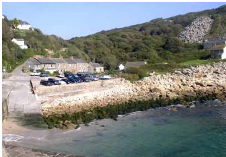
Looking back from Lamorna Cove Quay

Granite taken from Lamorna cove has been widely used in construction, most notably in the Thames Embankment. Stone from the cove was also used to construct the nearby church of St Buryan, whose 92 foot granite tower is an imposing local landmark often used as a line of sight by fishermen coming into port. In the late nineteenth and early twentieth centuries Lamorna became popular with artists of the Newlyn School.